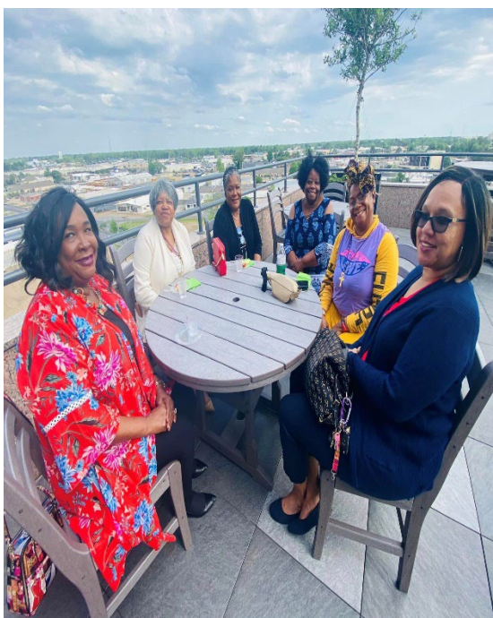
Monroe Chamber new member mixer