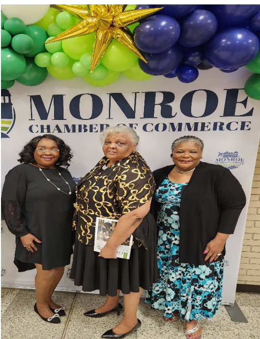
Monroe Chamber 102 nd Annual Banquet